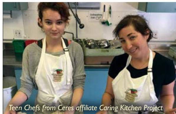
Teen Chefs from Ceres affiliate Caring Kitchen Project